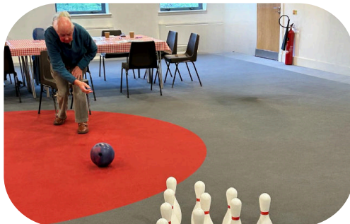
Fun and Games